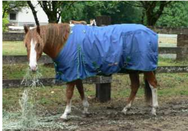
Previous CSRDT rescue, Patience , stays warm in this turnout blanket

Keep in mind that blankets also require maintenance. You should have your blanket cleaned and waterproofed at least yearly. Mend all snags and tears. By doing so, you will extend the life of your blanket, thus your investment.