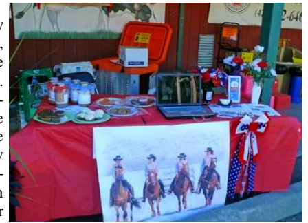
CSRDT's bake sale table at The Grange 9/2008

Sometimes we are desperate for funds and will try any effort to increase resources for our horses. Just recently, we even tried a bake sale at our local, favorite equine establishment: The Grange Supply in Issaquah, WA. Special thanks to our newest member, Teri, for her admirable baking skills! She provided us with some of the yummiest cookies, brownies & cupcakes to sell! She even put together these gift cookie jar mixes that only required that you mix everything together and bake, complete with adorable Cowgirl Spirit Rescue Drill Team logos! We couldn't have been more proud to display our goods!