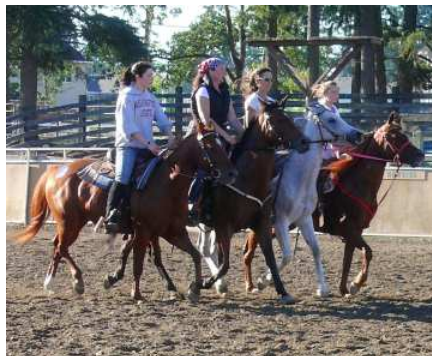
CSRDT members practice at the WLRC State Competition in July 2008

If you are interested in riding with Cowgirl Spirit, please feel free to contact us! We always welcome new people, and would love to have you come see our rescues, and decide if this is right for you!