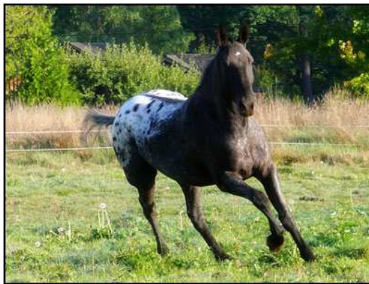
Pele , playing at CSRDT's headquarters, 9/19/2008

Pele is an extremely large, mellow 4 year old gelding (standing at a whopping 17.3 hh tall) that was originally rescued from an Appaloosa breeding farm in Eastern Oregon that was starving their horses. While many of Pele's pasture mates died of starvation, Pele was able to be rescued and properly rehabilitated.