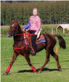
Cricket & Gina perform at Camp Korey Fall Festival.