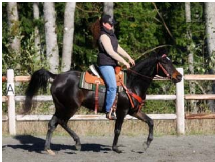
Gorgeous Jagger as he is today, Nov 2010.

When we picked up Jagger, he had dreadlocks down to his shoulder, so we nick-named him Fabio. He was up to date on everything from the vet, thanks to the barn owner, so he quickly went into training. He was lightly started under saddle in November 2005 and quickly became confident in his new job. He participated in trail rides with our members and continued to excel.