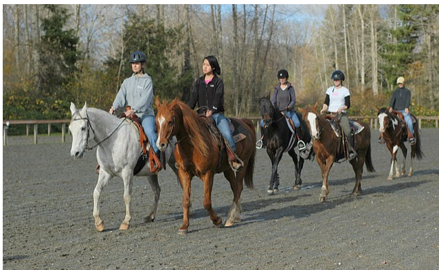
Riders train rescues in the sport of drill to prepare for the 2011 season.