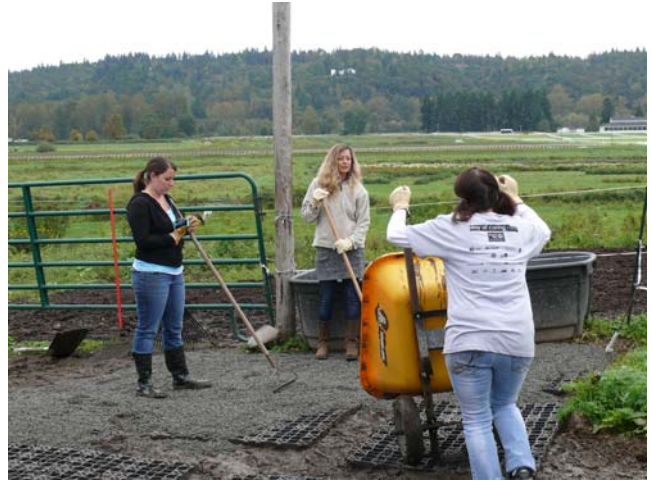
Microsoft Day of Caring volunteers spread gravel for mud control.

On September 24th, approximately a dozen Microsoft volunteers participated in King County's United Way Day of Caring. These volunteers arrived at the Cowgirl Spirit headquarters ready to work! We accomplished a lot of tasks that day, in particular, spreading a huge load of gravel around our supply shed, which was donated by Bird Boyz Builders ! This also required scooping out the excess mud and muck before setting rubber grates in place—it was back breaking work! We also groomed each of the rescue horses, picked manure, raked the round pen (and built drainage ditches), and weed wacked and mowed the property frontage. By the time we were done, our volunteers were beyond exhausted and our headquarters looked fantastic! And to top it all off, Microsoft donated financially to our organization for each hour these volunteers worked at our headquarters! Thank you to each of the volunteers and to Microsoft!