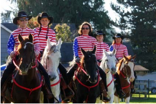
Cowgirl Spirit rescues Cricket, Casanova, Cheyenne, Dove & Skye perform at the Camp Korey Fall Festival.