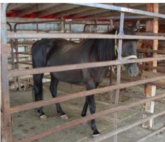
Cheyenne confined at the auction.