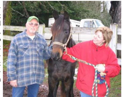
Jagger & his adoptive family, Dec 2005.

Jagger was originally rescued by Cowgirl Spirit in September 2005, after being abandoned at a local boarding facility when his owner fell behind on the monthly board payments. The barn owner contacted us in desperation, asking us to take Jagger or she would have to sell him to the next auction. We were told that he was 3 years old (at the time), halter broke and recently gelded. She was certain that he was purebred Arabian, but that she could not get his registration papers since Jagger's owner had abandoned him. We agreed to take him in, knowing that as an un-broke, grade, 3 year old, he'd likely go to slaughter.