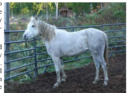
Honor relaxing in her quarantine pen.

However, much like what happened with Mollie at the October auction, Honor was led through the ring. The auctioneer started the bidding, so we quickly put our bid in. Pretty quickly, he was pointing at someone in the audience, asking if they wanted to outbid us. Again, we were fooled into thinking it was a private home, when in fact, it was the kill buyer. We were disheartened, but we weren't able to pay the extreme markup in price from the kill buyer, so had to leave her behind. Members of the Auction Horses board leapt to the rescue, donating funds for us to rescue her. Within two days of the auction, Honor was on her way home. She is settling in to her new daily routine, which includes lots of desensitization and hands-on one-on-one time with our volunteers!