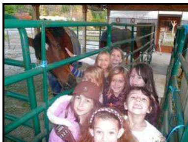
Dollar was the Girl Scout troop's favorite rescue!

about horses, their anatomy and physiology. In an effort to better describe what makes Cowgirl Spirit Rescue Drill Team different from other rescues in the Northwest, we introduced the girls to drill team maneuvers.