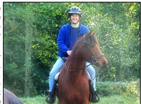
Vicki & Salsa enjoying a sunny autumn trail ride